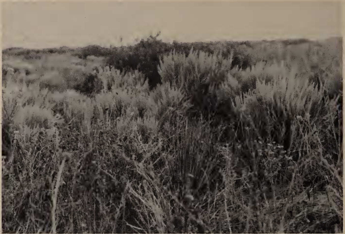
FIG. 8.—Sand sage-ragweed-yucca disclimax, north of Sudan, Lamb County.